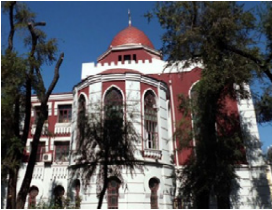
Harbin's Main Synagogue today.