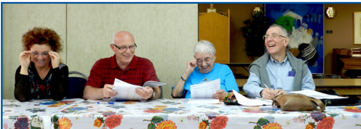
A lighter moment at the AGM