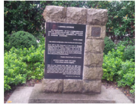
A plaque in Chinese, English and Hebrew

Union, we did find a long-lost relative from Belarus who survived the Holocaust because he had been conscripted into the Soviet Red Army. Although it is exceedingly unlikely, perhaps we cannot entirely rule out the possibility that some other distant family member might also have escaped the Holocaust by travelling from Belarus overland to Shanghai. If I had more time and the language skills, I might have investigated this remote possibility further in the Museum's archive. Perhaps this will be a project for a future visit.