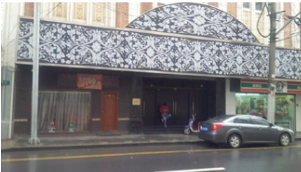
The Roy Roof Garden, built in 1928, the art deco restaurant was the largest place to avoid the summer heat in the Jewish isolated zone during World War II.