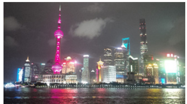
The modern Shanghai skyline at night.