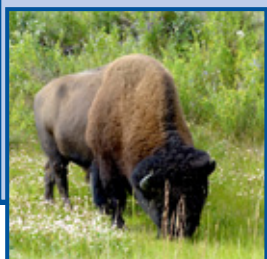
in Nothorn BC, July '16