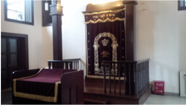
The Ohel Moshe Synagogue

If you are ever in Shanghai, you should consider spending a half-day or more in Little Vienna, the area where more than 20,000 Jewish refugees lived in the 1930s and during the Japanese occupation in the early 1940s. I was told that in the late 1930s, Shanghai was one of only two ports in the world that had an open door policy for Jewish refugees. Many arrived from Vienna, while some others made their way over land from Russia, via Siberia and Mongolia.