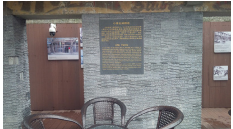
A brief history of Little Vienna